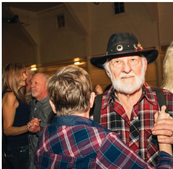
Some dancers opt for colorful clothes.