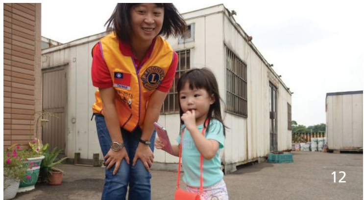
(1) An Accra Lion in Ghana holds one of the 114 children given cleft palate surgery. (2) Taoyuan Wu Fu Lions in Multiple District 300 Taiwan teach CPR skills to children. (3) Lions in District 325 B1 in Nepal provide health screenings for 450 people. (4) Erode Midtown Lions in India screen the vision of 317 people and support cataract operations for 87. (5) Elite Diamond Lions in Multiple District 300 Taiwan give haircuts to people in need. (6) Dhaka Rojoni Ghandha Lions in Bangladesh bring supplies to people in a flooded area. (7) Desamparados Lions in Costa Rica prepare to plant 150 trees. (8) Kolkata Youth Lions in India publicize road safety. (9) Lake Oswego Lions in Oregon get ready for a trip to a classroom of fourth-graders, where Lions will relate the history of the American flag. (10) Sincelejo Sabanas Lions and Leos in Colombia visit children at a hospital. (11) Milagro Melvin Jones Lions deliver food to people after a flood. (12) A Lion in District 300 G2 in Multiple District 300 Taiwan spends time with a child after Lions delivered food and supplies.