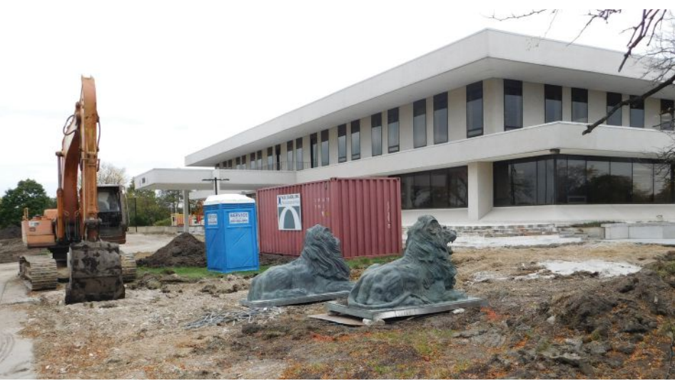
Lions headquarters is being improved including a new statue of founder Melvin Jones.