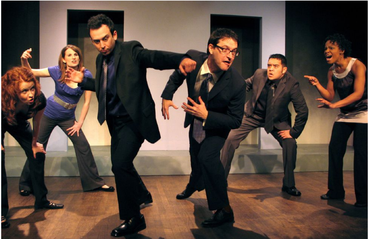
Second City is world-famous for its comedy.

from the 1,200-acre Lincoln Park, which runs for miles parallel to the lake. The free Lincoln Park Zoo houses gorillas, tigers and, yes, lions. Lincoln Park is an interesting amalgam of money, nature and cutting-edge culture. Second City has given the world Bill Murray, Tina Fey, Steve Carell and many other stars. Founded in a church basement in 1974, Steppenwolf Theatre is now the city's top stage. Alumni include John Malkovich, Gary Sinise and John Mahoney.