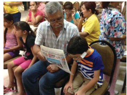
A man shows a boy with new glasses in Caborca, Mexico, how he can read the newspaper himself now that he can see clearly.