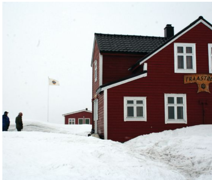
Lions refurbished this hut and other accommodations near a beloved national park.

Lions are using the sites to host children with cancer, young people with mental health issues and others who benefit from time in the wilderness.