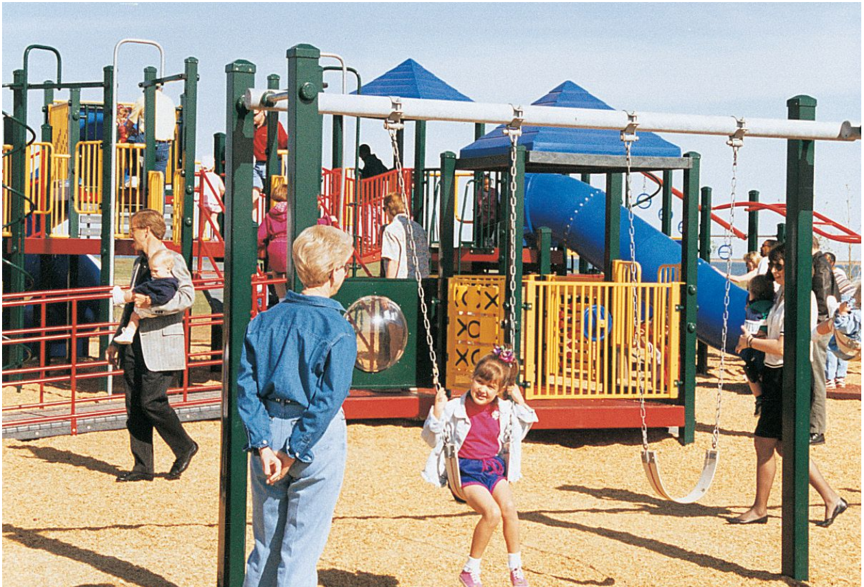
Families enjoy the playground in 1996.