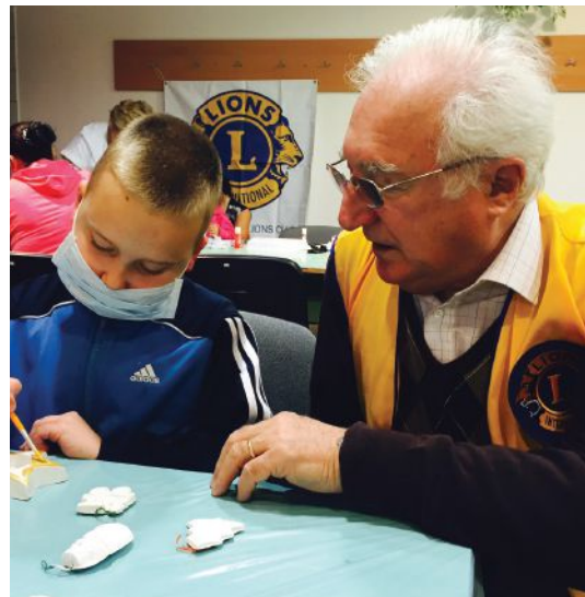
A Lion helps a child make a Christmas ornament.