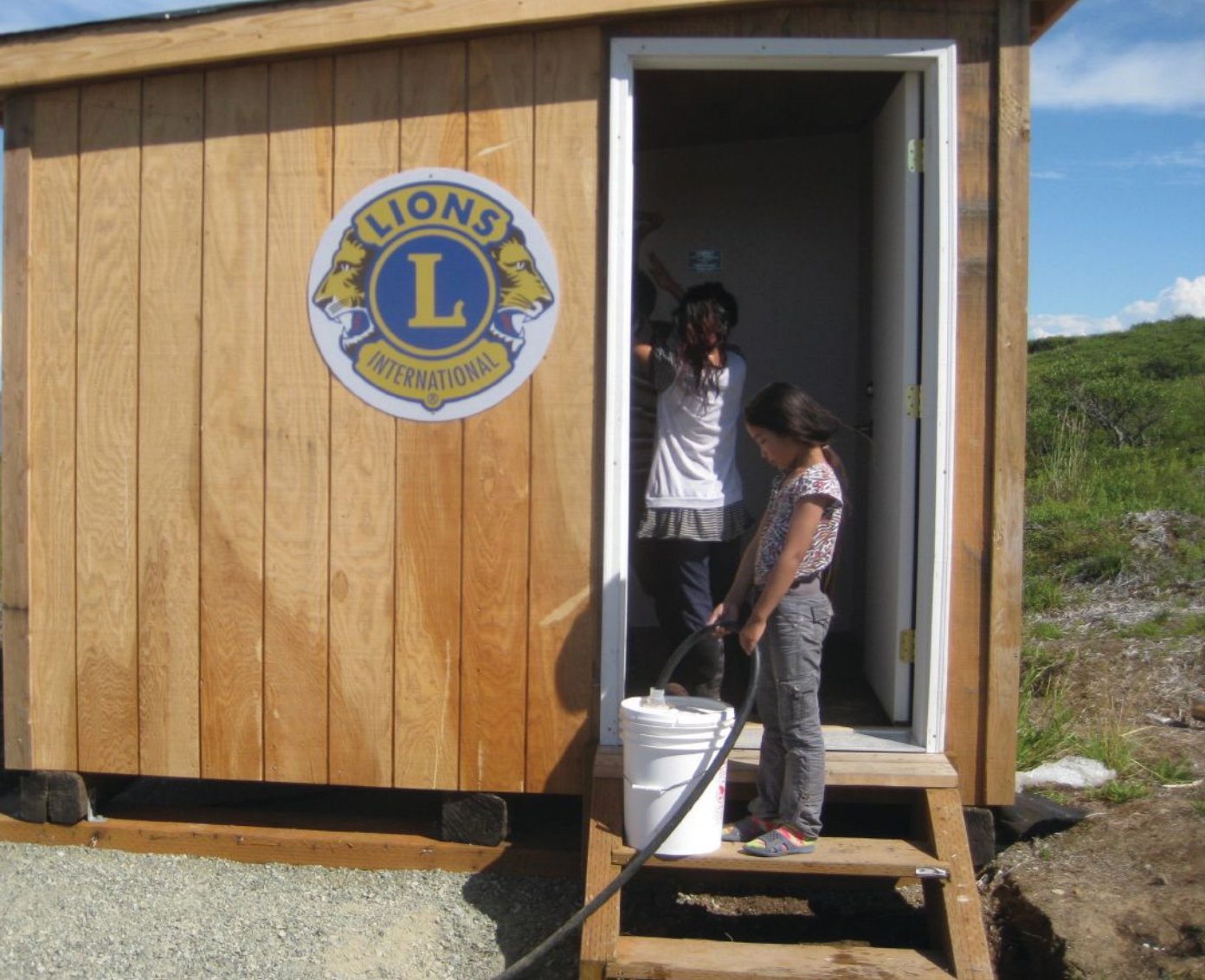
The well house and deep-well hand pump made possible by Lions provides water for the new village of Mertarvik.

an electric pump. But because Mertarvik has no electricity, there was no way for people to actually get water out of the well. Instead, the few people who had moved there had to travel several miles to a spring for fresh water.