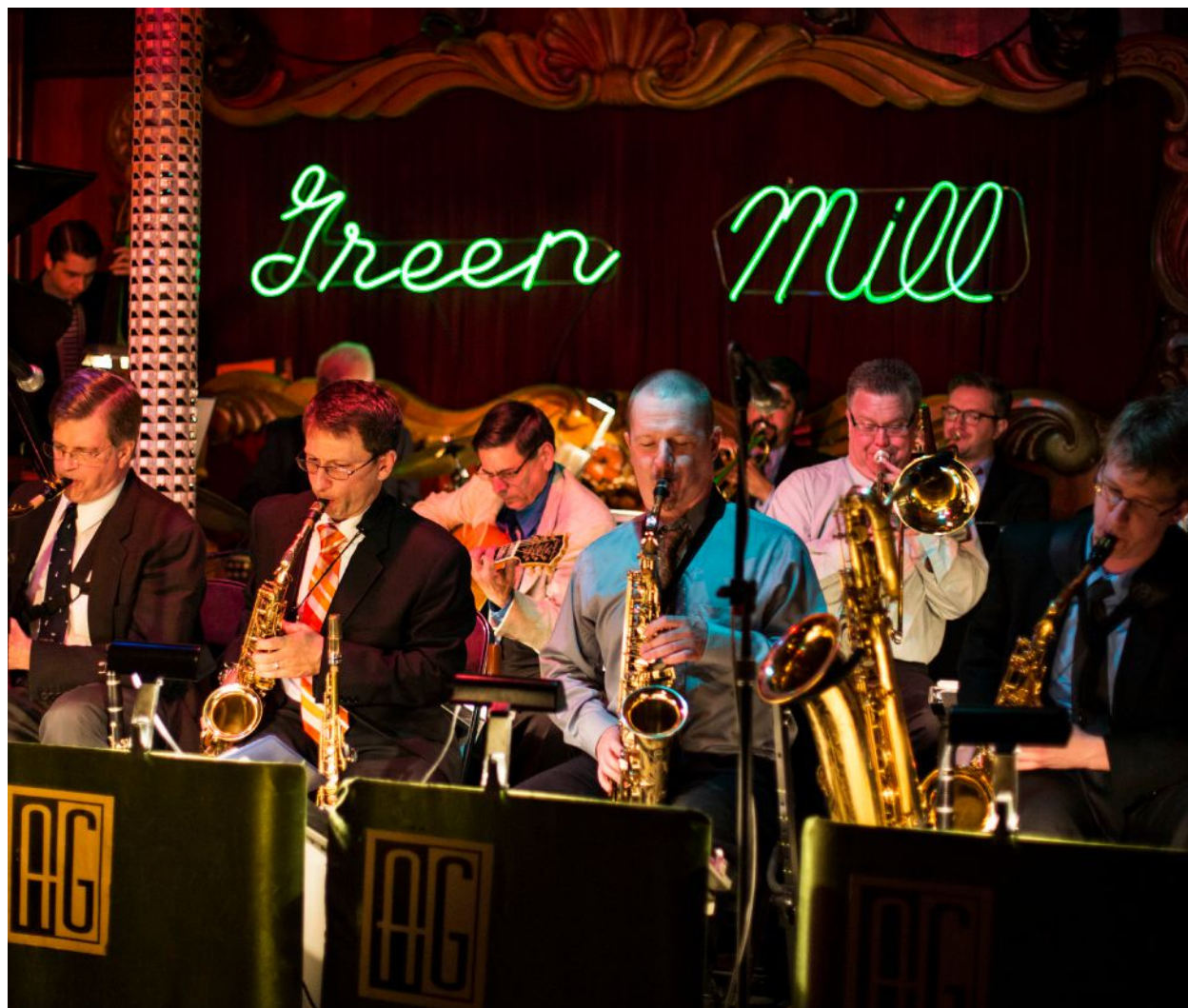
The Green Mill is the nation's oldest continuously run jazz club.

The South Side also is the traditional stronghold of the mighty and numerous "South Side Irish," the Bridgeport neighborhood. Left standing, mute testimony to its importance to the city's economy and identity, is the gate of the Union Stockyards. From the Civil War until