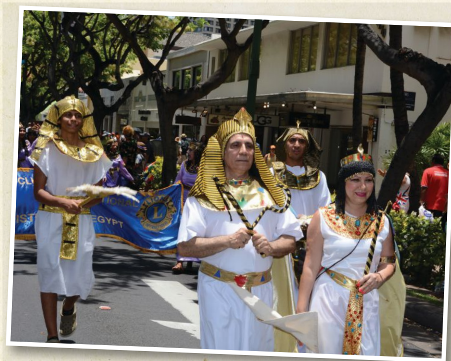
Lions from Egypt march at the 98th International Convention in Honolulu in 2015

The parade is often the largest procession many host cities have seen in years, and with thousands of participants, it is truly spectacular to behold. Fellow Lions, convention guests and residents line the streets to exchange greetings and cheer on the delegates.