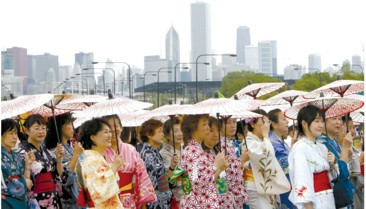
Japanese Lions parade in 2007 at the 90th International Convention in Chicago.