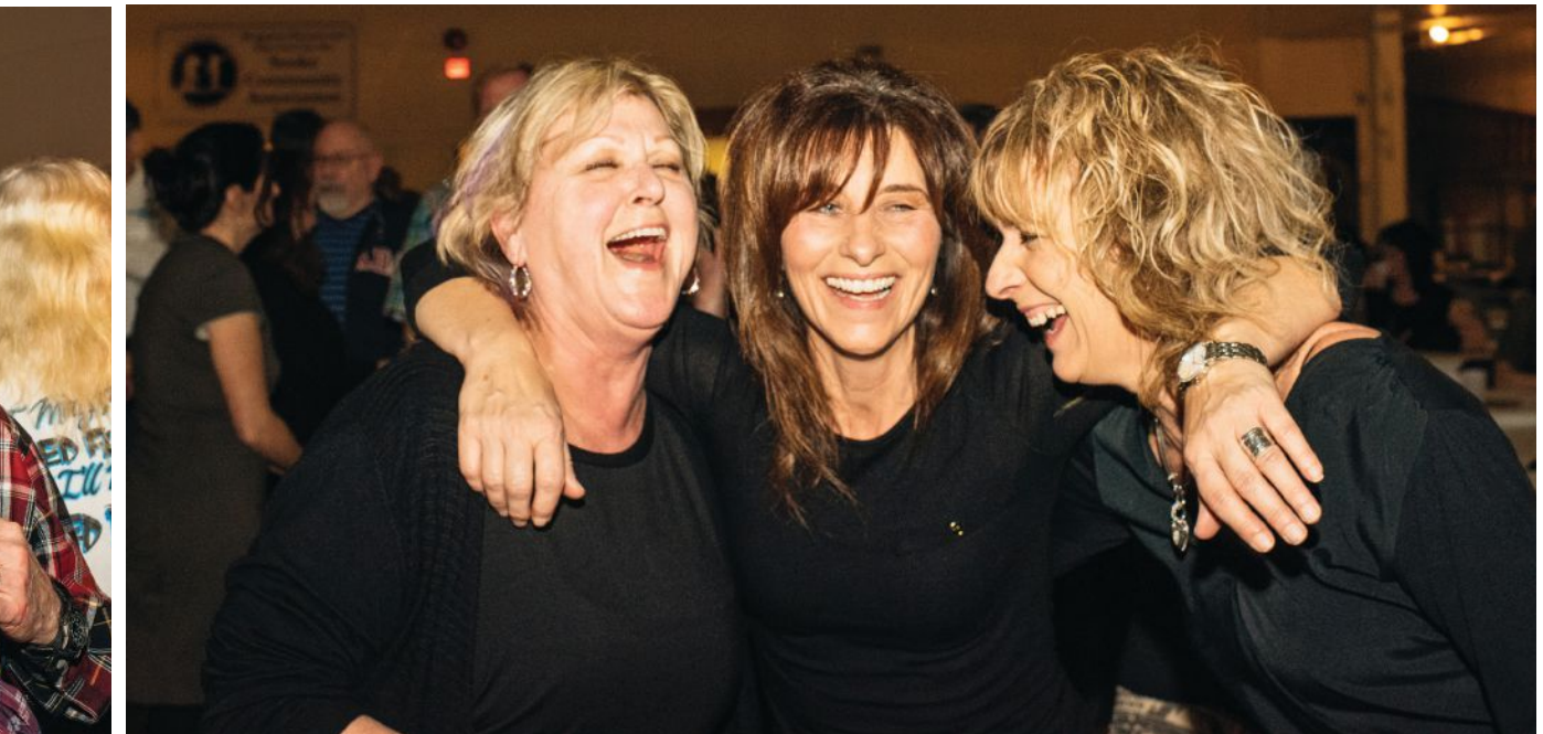
A typical Lions' event, the dance allows old friends to catch up.