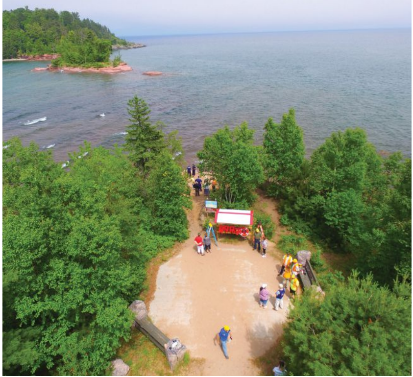
Lions built the life-saving station at Little Presque Isle Point over a weekend.

Little Presque Isle is one of the most beautiful and isolated beaches in the Upper Peninsula of Michigan. The beach also is deceptively dangerous. Swimmers in the shallows who enjoy the 65-degree water can succumb to the currents and quickly find themselves in 40-degree water coping with fierce winds and waves. In mid-June two swimmers drowned there.