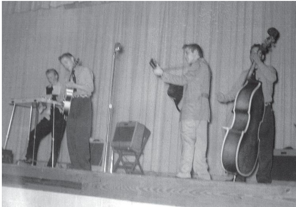
Elvis Presley gives the Lions something to roar about in March 1955 in DeKalb, Texas. Also playing are Jimmy Day (left), Scotty Moore and Bill Black (right).

In 1955, Elvis, 20, was a raw, mostly unknown talent. A country boy quite unsure of himself, he was so nervous performing live