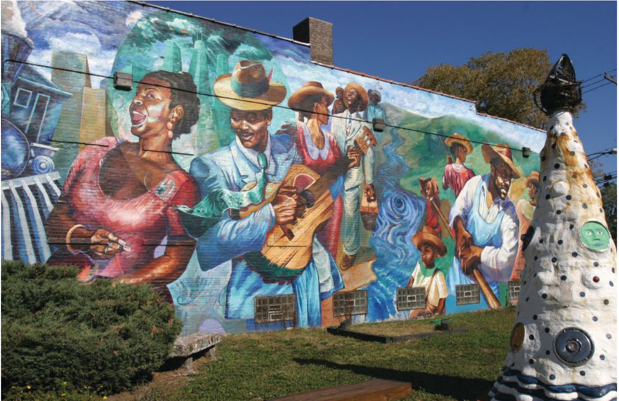
A mural in Bronzeville celebrates its African-American heritage.

the 1920s, more meat was processed in Chicago than in any other place in the world.