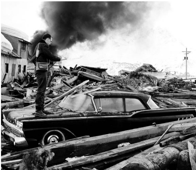
A photographer in Valdez, Alaska, looks over wreckage from the 1964 Good Friday earthquake.

The new Lions club in the village helped it grow, raising funds for a library. Port Lions also took on other needs such as providing food and clothing for villages scorched by wildfires and giving a wheelchair to a local fisherman whose legs were amputated after an accident. The club disbanded in the 1980s after a local cannery and sawmill closed, leaving the town reeling. But a new harbor and health clinic in recent years as well as a flourishing school have helped Port Lions turn a corner.