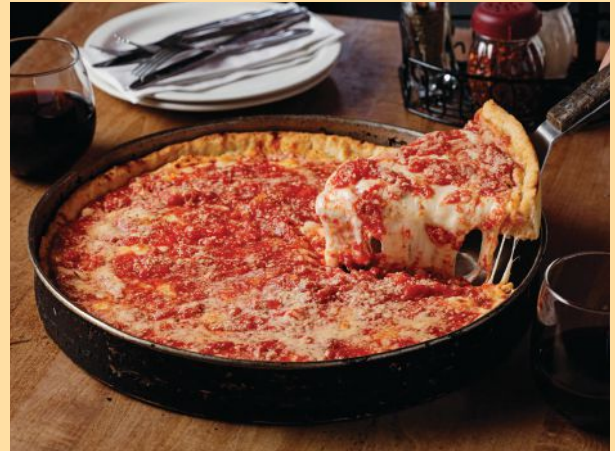
Don't overlook the deep dish pizza at Lou Malnati's.

Everyone knows deep dish pizza and Chicago are synonymous. Well, everyone is wrong. Deep dish pizza did originate in Chicago. But the city's thin-crust options are just as good, and quite a few Chicagoans prefer those to gut-filling deep dish. Having said that, for great deep dish pies, the holy trinity of that food group, drawing tourists and residents alike, are Pizzeria Uno , where it all started, Pizzeria Due , where wait times are less; and Gino's East , whose walls and table are crazily covered with graffiti. But don't overlook Lou Malnati's , famous for its flaky, buttery crust.