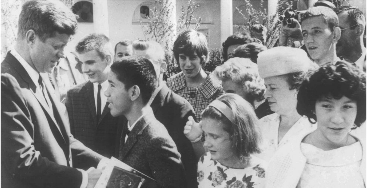
In the Rose Garden, President Kennedy greets the blind teenagers on the bus.