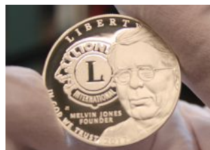
A freshly minted coin is displayed.

Lions’ centennial commemorative coin is now available for purchase from LCI’s Club Supplies or the U.S. Mint. The $1 coin with a proof finish will cost $52.95 with a special introductory price of $47.95 (only through the U.S. Mint.) The offer expires 3 p.m. EST on Feb. 21, 2017. The U.S. Treasury minted the first Lions’ coin at a ceremony in early November. The coin shows founder Melvin Jones and the Lions logo on one side and a family of lions on the other. The U.S. Treasury will produce up to 400,000 coins; $10 of each purchase is authorized to be paid to Lions Clubs International Foundation. Commemorative coins often cost $30 or more. To purchase these beautifully-crafted coins, visit lionsclubs.org/coin .