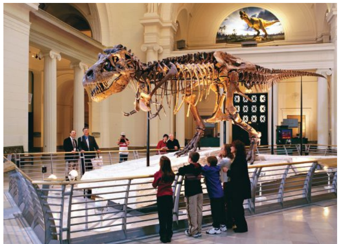
The Art Institute of Chicago (top) is a natural photo spot for Lions. The Shedd Aquarium showcases creatures of the deep sea while the Field Museum contains a creature 65 million years old. The Crown Fountain at Millennium Park features towers from which Chicagoans spray mouthfuls of water.