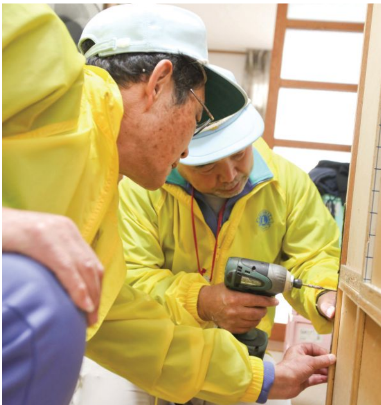
Lions secure furniture in the home of a person with a disability.

Public safety announcements urging bracing of large pieces of furniture are regularly made in earthquake-prone Japan. But few people with disabilities, especially those living alone, comply with the recommendation, according to the Japanese LION.