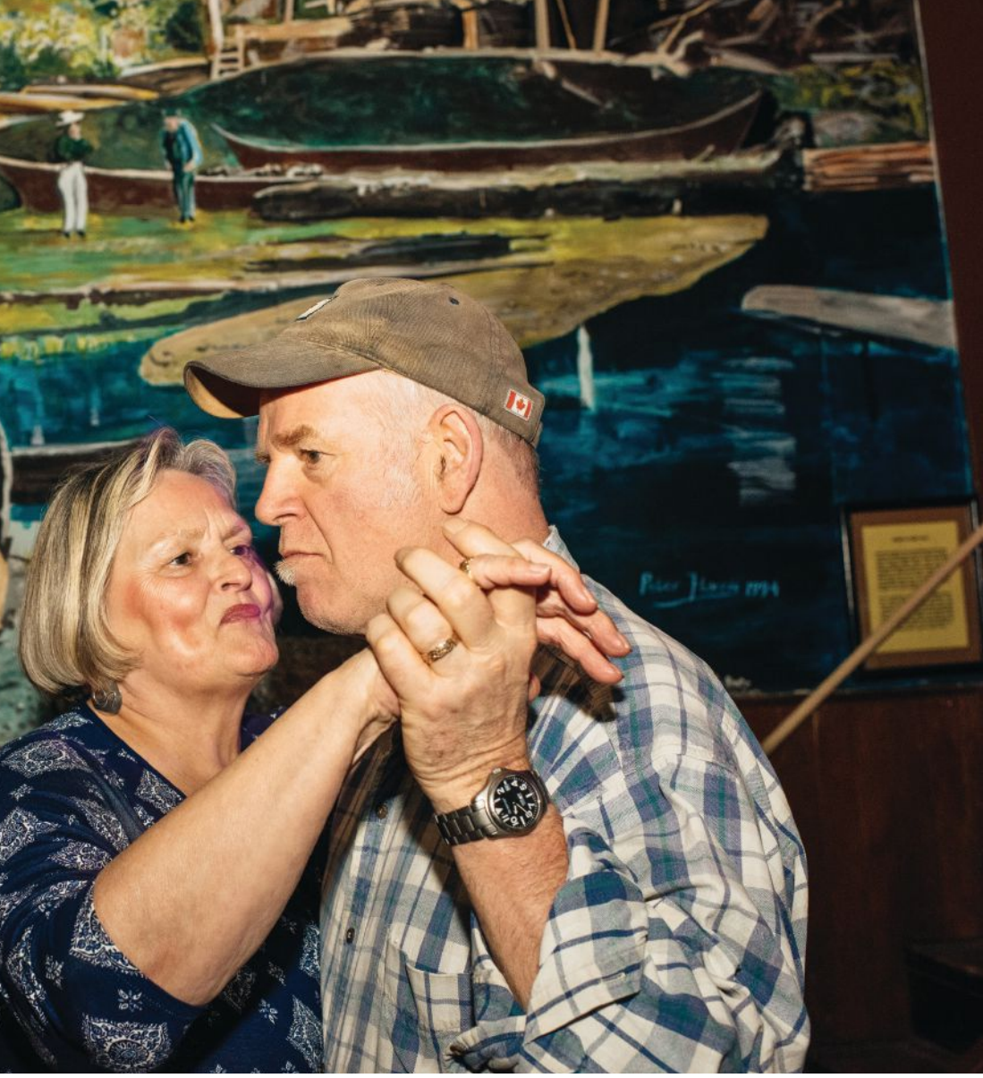
Couples dance to popular songs of the '50, '60s and '70s.