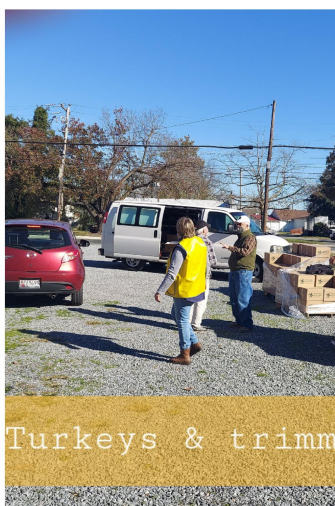
Turkeys & trimmings