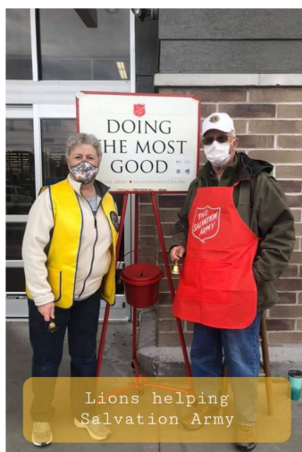
Lions helping Salvation Army