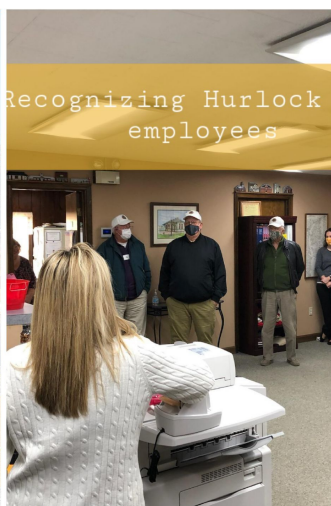
Recognizing Hurlock employees