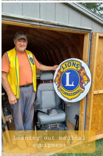
Loaning out medical equipment