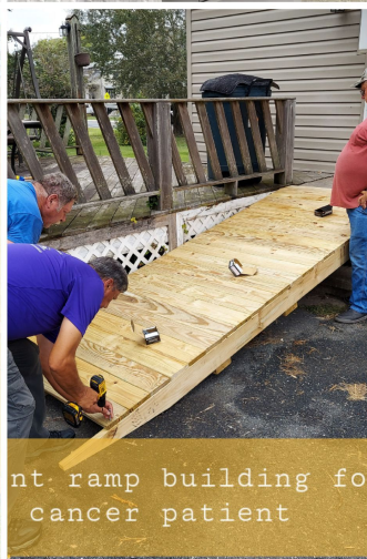
ent ramp building for cancer patient