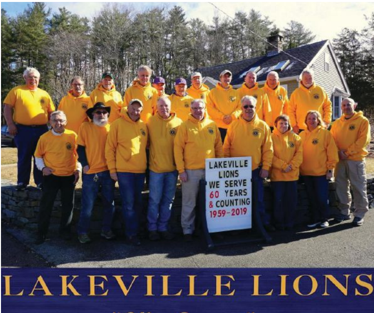
The Lions Club of Lakeville in Massachusetts celebrated their 60th anniversary at their new clubhouse. After 35 years of ownership they sold their facilities at Camp Joe Hooker, a historic Civil War site, and renovated an old nursery and local eyesore to make their "den."