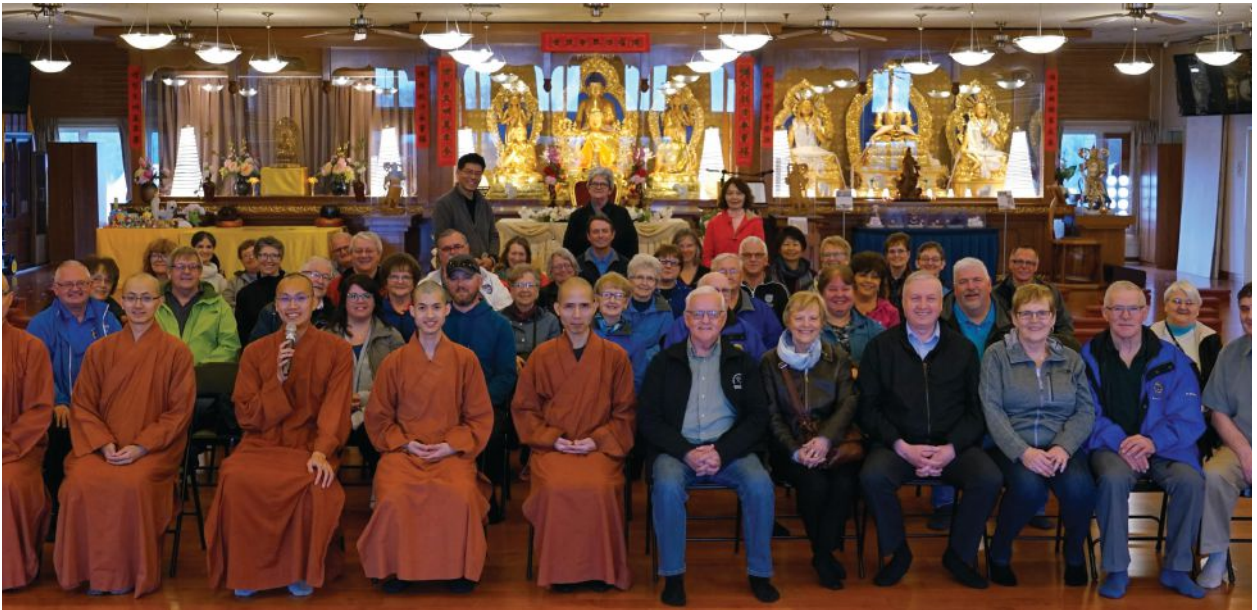
Members of the Summerside Lions, Kensington Lions, and St. Eleanors Lions and Lionesses , enjoyed a private visit and homemade cookies with the Buddhist monks in Little Sands on Prince Edward Island, Canada.