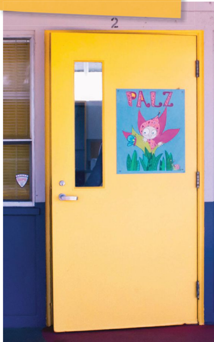
The yellow door welcomes kids who need a break from the classroom to center themselves and refocus so they can learn.

“We have these kids for six to seven hours a day—a good portion of their waking hours. It’s up to us to help our students.”