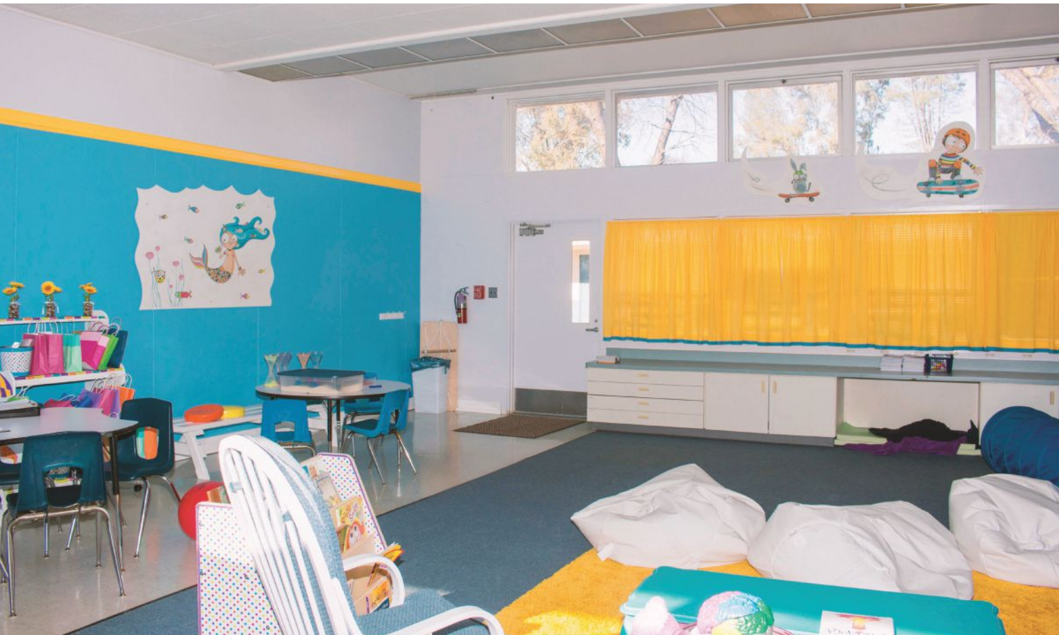
The PALZ room at Sycamore Elementary in Redding, Ca, is a welcome place for kids to refocus.