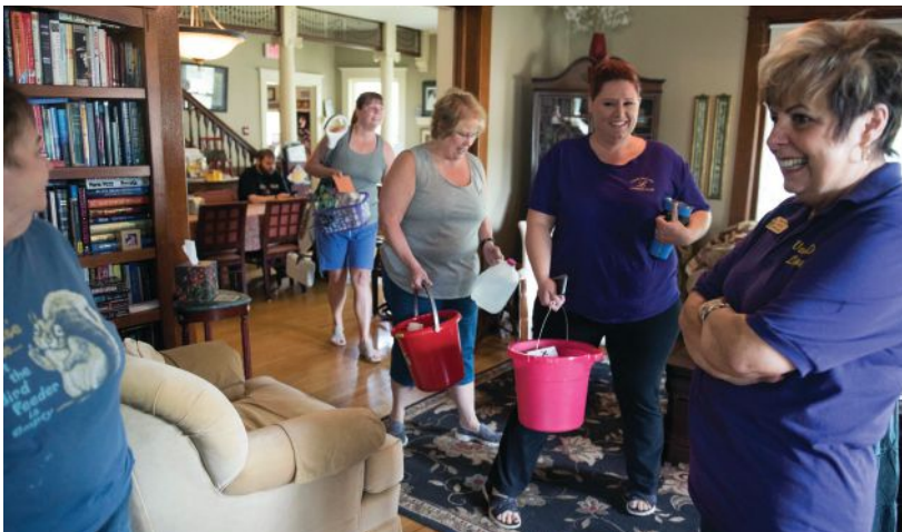
Lioness clubs have long been workhorses of the Lion family. Here the Van Dyne and Fond Du Lac Lionesses help maintain a home for transplant patients and their families.

Help spread the word to the hardworking Lionesses in your district. It's never been a better time to become a Lion.