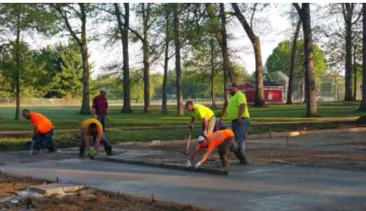
The Laingsburg Lions in Michigan built a new basketball court for their community.

In Michigan , the Laingsburg Lions Club replaced their deteriorated half basketball court in a city park with a new US$32,000 court and six baskets. Community members of all ages are thrilled to have a new place to play and exercise..